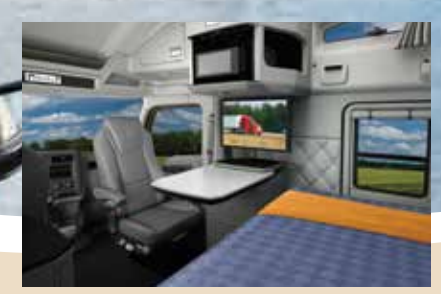
Heavy-duty Commercial Vehicle and Refrigeration Units