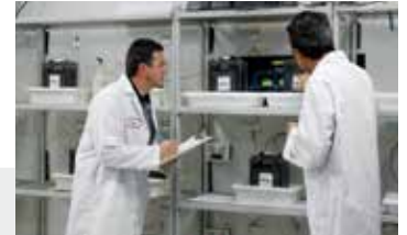
Prototype development and evaluation

To ensure the quality and superior performance of our batteries, Trojan applies the most rigorous testing procedures in the industry to test for cycle life, capacity, charger algorithms and both physical and mechanical integrity. Trojan's battery testing procedures adhere to both BCI and IEC test standards. Trojan's state-of-the-art R&D facilities include charger characterization and analytical labs, battery prototype and evaluation labs and battery autopsy centers all dedicated to providing you with a superior battery that you can rely on.