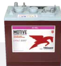
MOTIVE 6-VOLT GEL