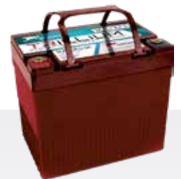
TR 25.6-25 LI-ION

Microprocessor Amp-Hour Life Tracking SOC Gauge Battery Management System Cell Balancing