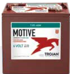
MOTIVE 6-VOLT AGM