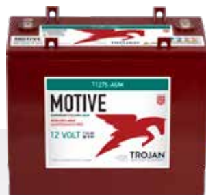
MOTIVE 12-VOLT AGM