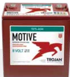
MOTIVE 8-VOLT AGM