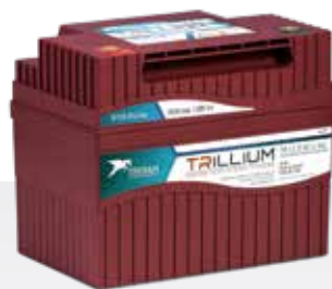
TR 12.8-92 LI-ION

Microprocessor Cell Balancing CAN Communications Amp-Hour Life Tracking SOC Gauge Battery Management System